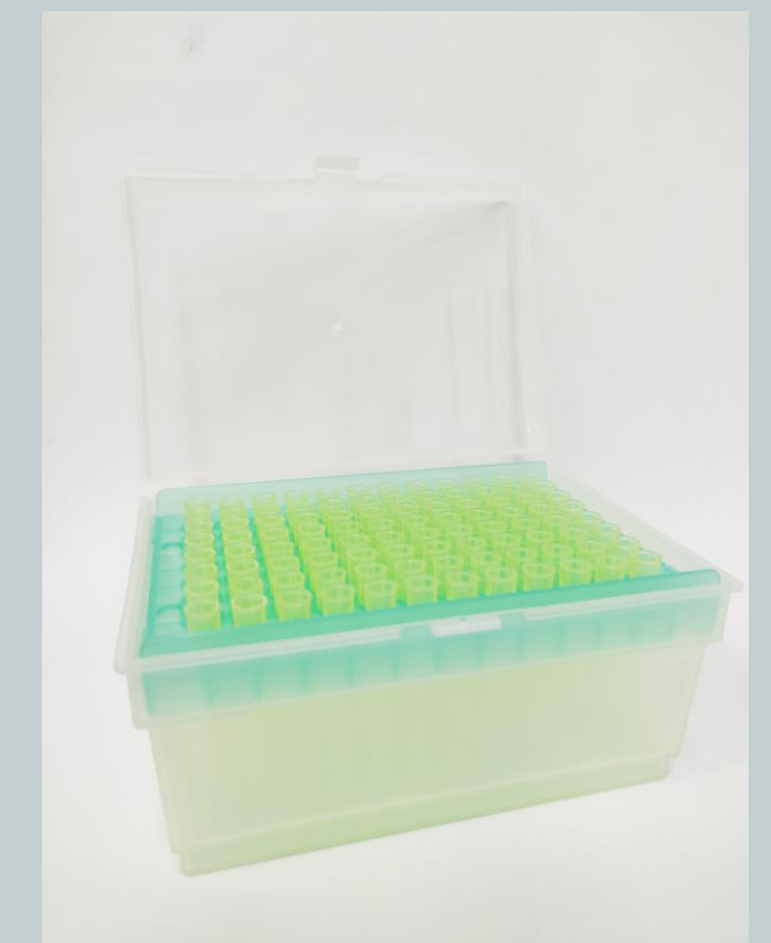
Packed in a rack (Racked tips)