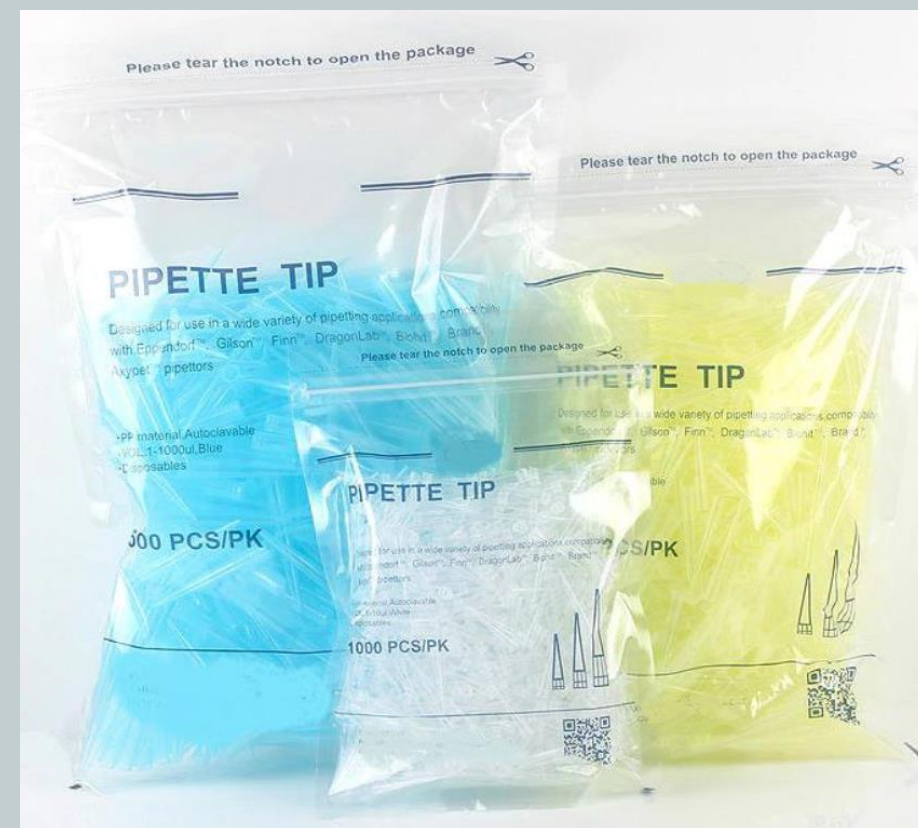
Packed in a bag (Bulk tips)